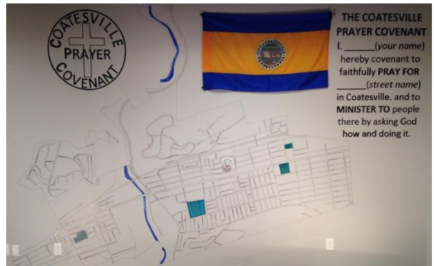
Our 12 foot wide indoor city prayer map.