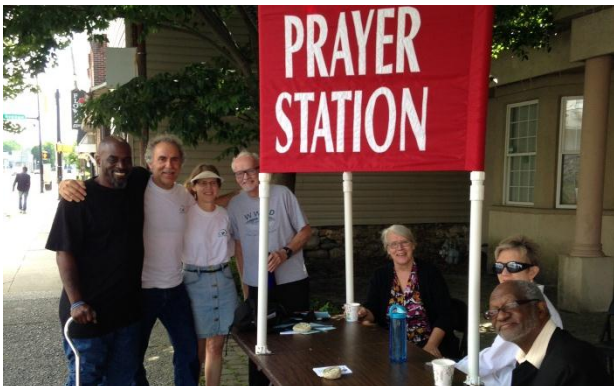
Some of our June 10 th Prayer Walk group friends.